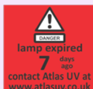
Lamp change warning