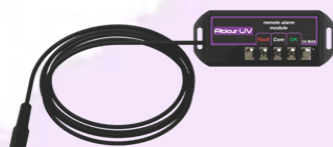
Volt Free Contact Module