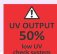
Low UV warning screen