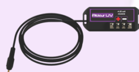
4-20 mA Module (used with UV sensor)