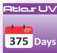
Lamp life remaining