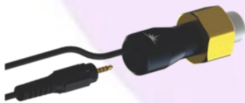
UV Sensor Module