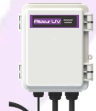
Solenoid Connection Module